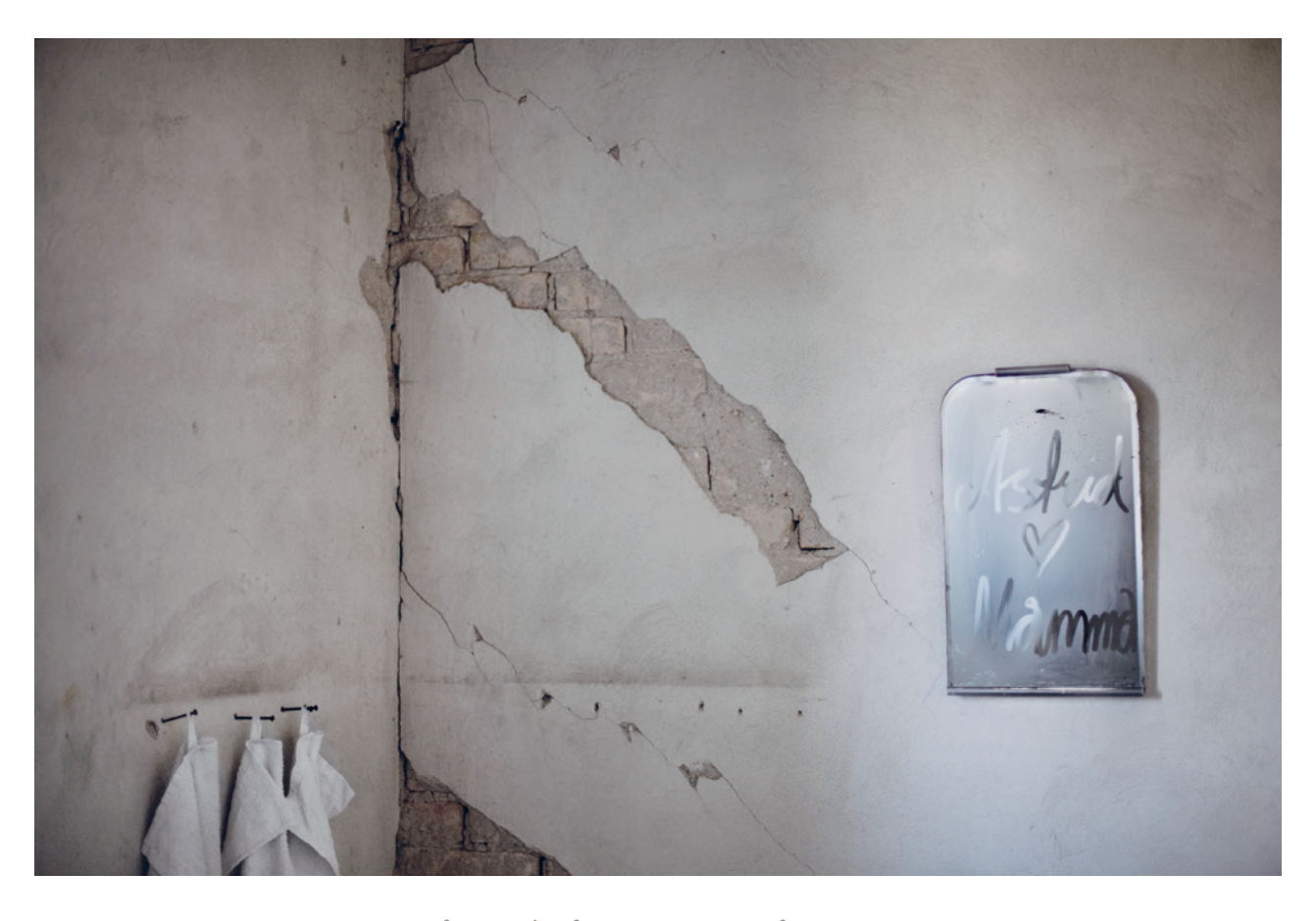
place holder - a welcoming environment with many secrets